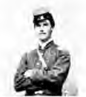
SLOOP DEUT, By B. MELLICE